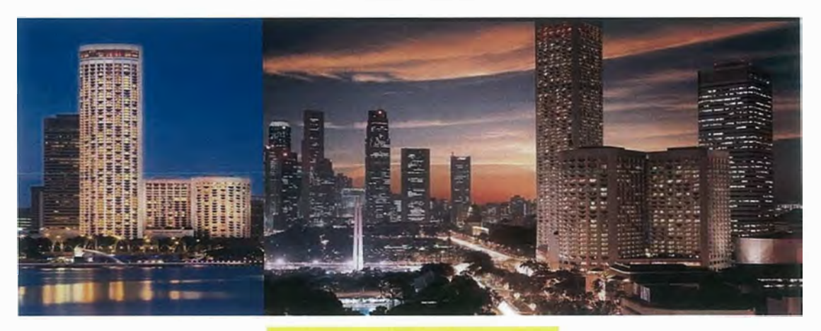
Swissôtel The Stamford

www.fairmont.com/singapore www.swissotel.com/singapore-stamford