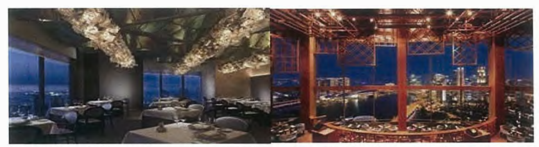
ALLIGATOR PEAR (Poolside Restaurant & Bar) Szechuan Court & Kitchen (Szechuan & Cantonese)

A wealth of culinary delights and a wide variety of entertainment is on offer in Swissotel The Stamford's 15 restaurants and bars. Equinox Complex is Singapore's most exciting dining and lifestyle hub, with five vibrant restaurants & bars, four private dining rooms and a capacity of 900 guests. Treat yourself to the innovative, fresh French creations at the elegant JAAN or to modern European cuisine with traditional values at Equinox Restaurant, followed by award-winning cocktails at the luxurious City Space lounge or pulsating beats at New Asia. From authentic Singaporean fare at Kopi Tiam, Swiss specialities at Cafe Swiss to the cosy Lobby Court or Introbar, the possibilities are endless.