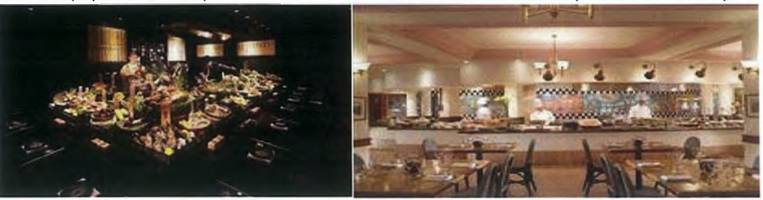
ASIAN MARKET Café (Asian & Halal Buffet)