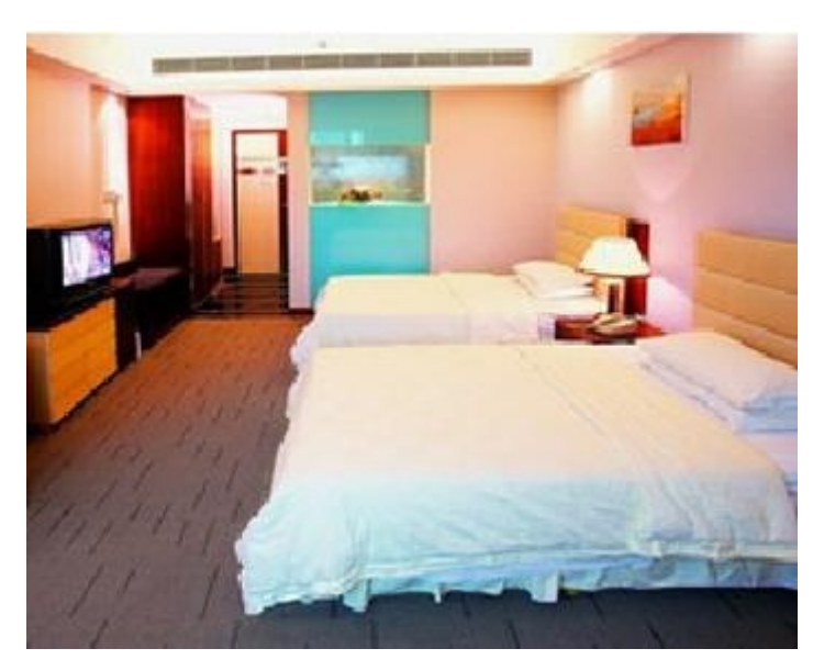
Standard Twin Room