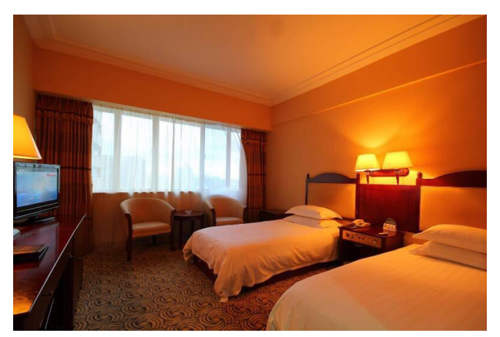
Standard Twin Room