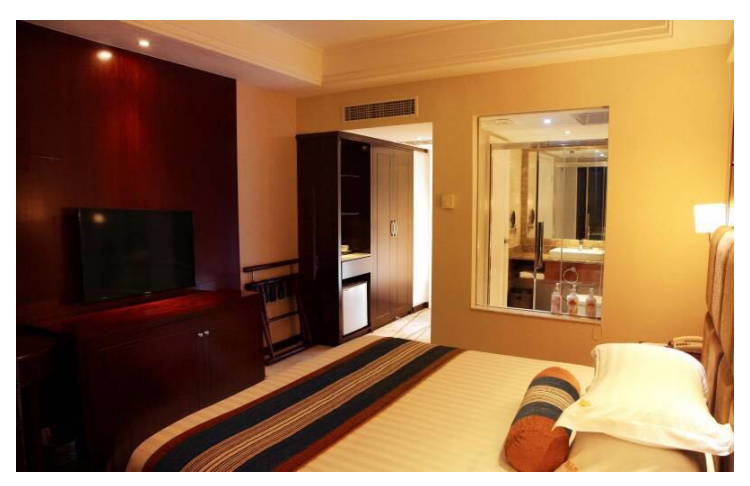
Deluxe King Room