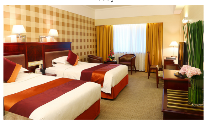
Deluxe Twin Room