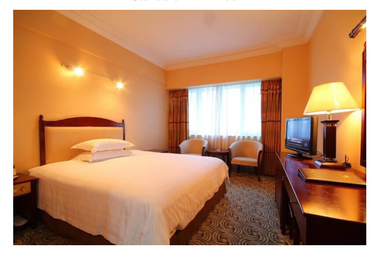
Superior King Room