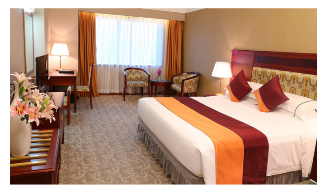
Business Twin Room